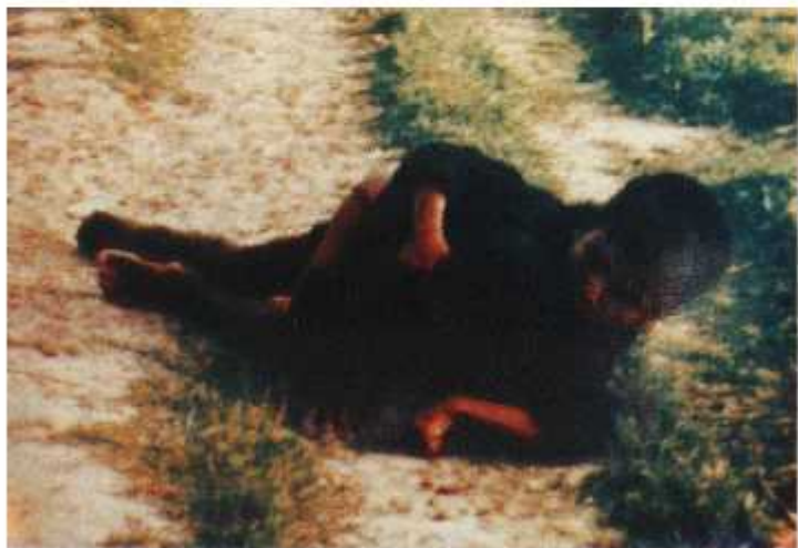
When these two boys were shot at.