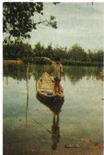
Kinh river, in the west of Mỹ Hội sub hamlet, one of the places the massacre happened.

March 16th, 1968 took place mostly at Thuận Yên sub-hamlet (i.e Xóm Làng), Tư Cung hamlet (My Lai 4) and at Mỹ Hội sub-hamlet, Cổ Lũy hamlet (My Lai 2).