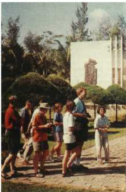
Foreign Guests visiting Sơn Mỹ