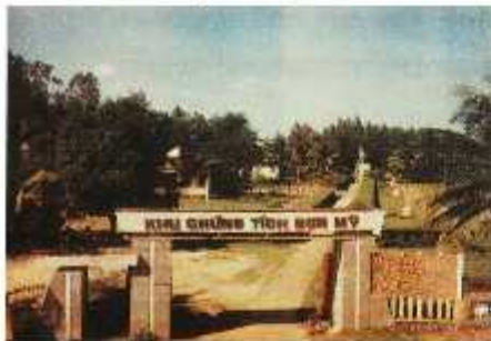
Panorama of Sơn Mỹ Vestige Area