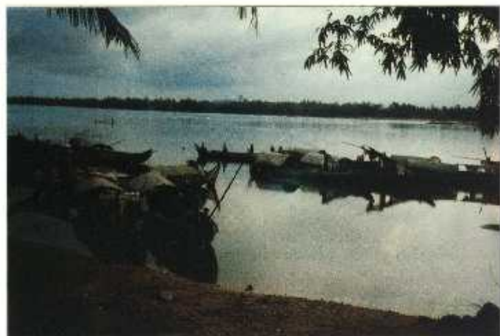
Trú Khúc river

of 4000-year civilisation have been distinct and stable. During the colonial-federal period, Sơn Mỹ belonged to Tổng Châu (equivalent to present several villages of Sơn Tịnh district), one of the four communes of Sơn Tịnh district, Quảng Ngãi province.