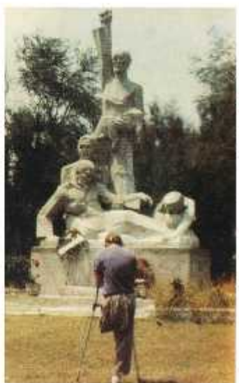
An American Veteran in front of Sơn Mỹ Monument