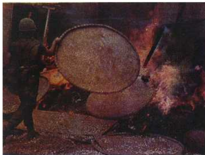
Burning all

The Platoon I, led by Calley, was the first troop rushing into Thuân Yên sub-hamlet and conducted the methoded and planned massacre, in which the G.Is was divided into several groups, stretched out in various directions, one did the firing, searched to arrest the civilians, one burnt huts, exploded mines to collapse the shelters, the others fired at buffaloes and oxen, cut down the trees. As well as in Mỹ Hội sub-hamlet of Cổ Lũy hamlet, the G.Is'extinction reached to the pinnacle. Haeberle's photos obviously recorded those scences.