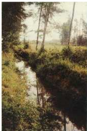
The place where 100 people were once massacred

Sơn Mỹ, a small village in Vietnam, is still always a call of conscience to everybody in Vietnam as well as the world over. In fact, from the date when the Sơn Mỹ Vestige Area was built, millions of visitors all over the world have come; and the number of visitors increases day after day. They are not only ordinary people but also businessmen, journalists from well-known news-agencies, radio and television corporations, social activists, etc. Especially, among the visitors more and more