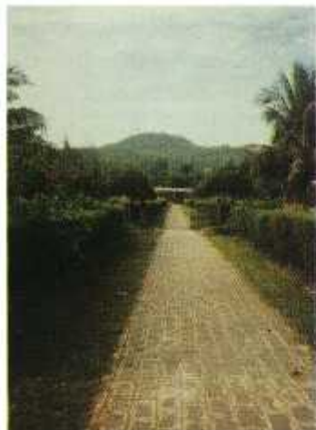
The Elephant Hill, opposite the irrigation ditch (looking from Sơn Mỹ Vestige Area)